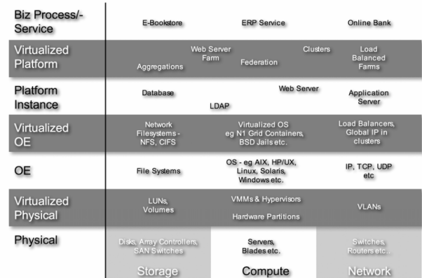
Figure VIII - Some Grid Component Classes

The Enterprise Grid Alliance ( http://www.gridalliance.org ) has published a reference architecture that defines layers of virtualization. A diagram taken from the EGA Reference Architecture is shown below.