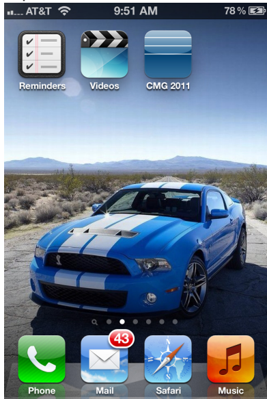
CMG 2011 Icon

For the very first time, CMG has an iPhone App to help you navigate the Conference. Here are three representative screenshots: